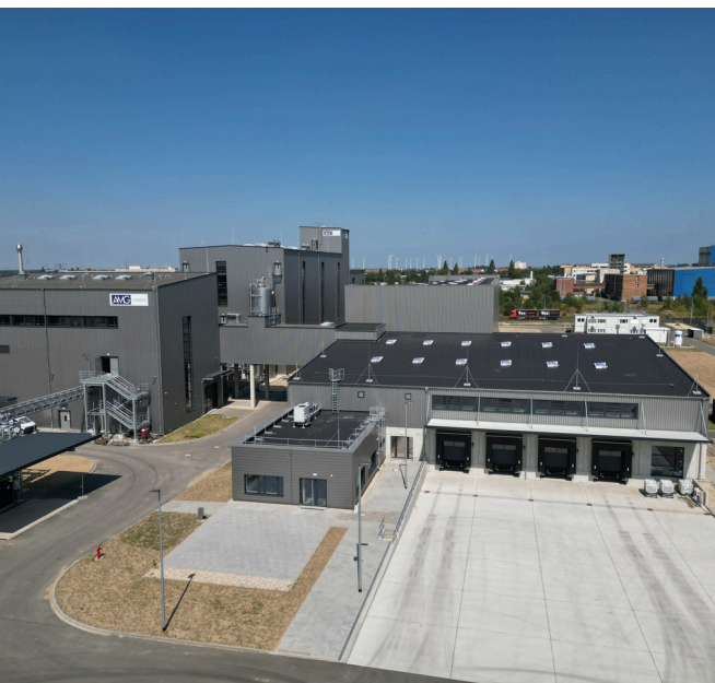
AMG Lithium, Lithium Refinery, Bitterfeld-Wolfen, Germany